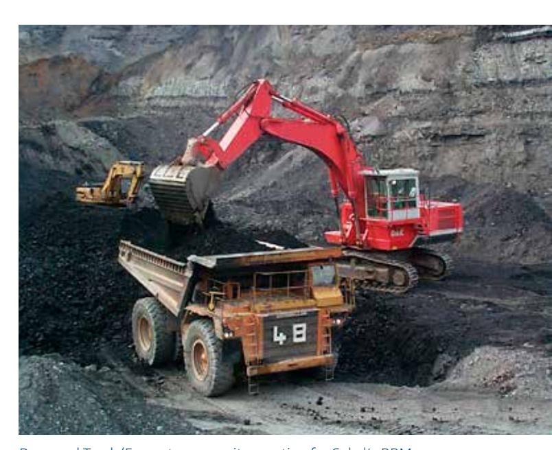
Proposed Truck/Excavator open pit operation for Cokal's BBM coking coal mine.