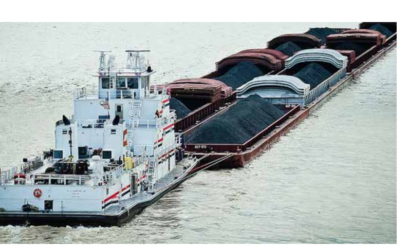
Coal will be transported along the Barito River.

Cokal Limited (Cokal) is an Australian listed (ASX:CKA) coal company, with interests in coal exploration in Kalimantan, Indonesia and Tanzania. Cokal's premier project in Indonesia, Bumi Barito Mineral (BBM), covers 19,920 hectares (Ha) and straddles the Barito River. Proving up Coal Resources to the Australian Joint Ore Reserves Committee (JORC) Code standard for early production is their priority. Initially, it saw 77 million tonnes (Mt) Total Resource comprised of 70Mt Inferred Resources and 7Mt Indicated Resources with 70% coking coal and 30% PCI (Pulverized Coal Injection). Recently this was upgraded to 261Mt using Minex. Using Minex, this estimate was recently upgraded to 261Mt, comprised of 10.5Mt of Measured, 13.5Mt of Indicated and 237Mt of Inferred Resources.