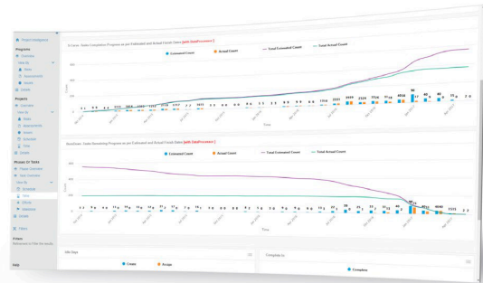
Track task completion progress.

A platform approach brings the best of PLM and analytics together to put the single source of truth into product and project context. A single platform combining PLM and big data analytics gives companies the ability to not only gain insights quickly, but to immediately drill down to further investigate or act on the underlying information because it is all located in one place. PLM Analytics has the power to turn vast amounts of data into usable information.