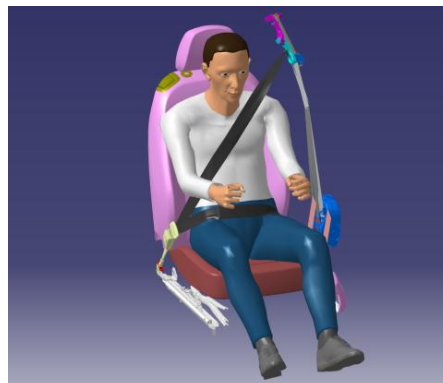
Fig. 1: Analysis of ergonomic belt routing

To analyze certain design criteria such as belt length and storage, you could of course calculate belt routing digitally without using human beings or test devices. Here the belt tongue can be inserted into the belt lock or the belt can be analyzed in unfastened resting position.