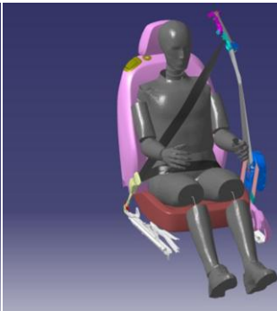
Fig. 3: Designing with crash dummies