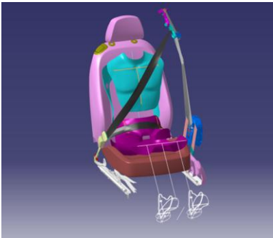
Fig. 2: Testing seat belts for eBTD compliance