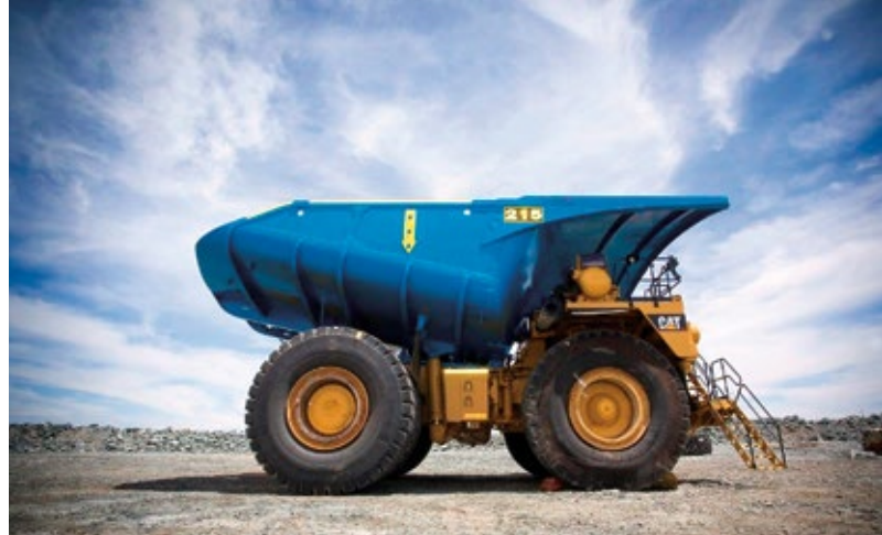
The dump truck tray extends over the driver's cab and can be as long as the entire vehicle.

Load characteristics such as density and stability are often quite different from site to site. “Usually, every customer and even every mine has different trucking conditions,” Sun says. “For instance, material composition, site restriction, and haul road surface can vary a great deal. That’s why each tray project can be different.” In addition, overloaded haulages are a fact of life in mining, providing additional load and fatigue on the trays.