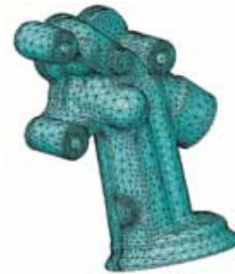
Model for an oil filter adaptor NVH (noise, vibration, and harshness) analysis.

The CAD template defines the geometry. The CAE template includes the basic information for the simulation, including mesh, load, and boundary condition requirements. Because the templates are linked, a CAE analyst can easily change the key parameters, which automatically updates the geometry as well as the mesh in the analysis model.