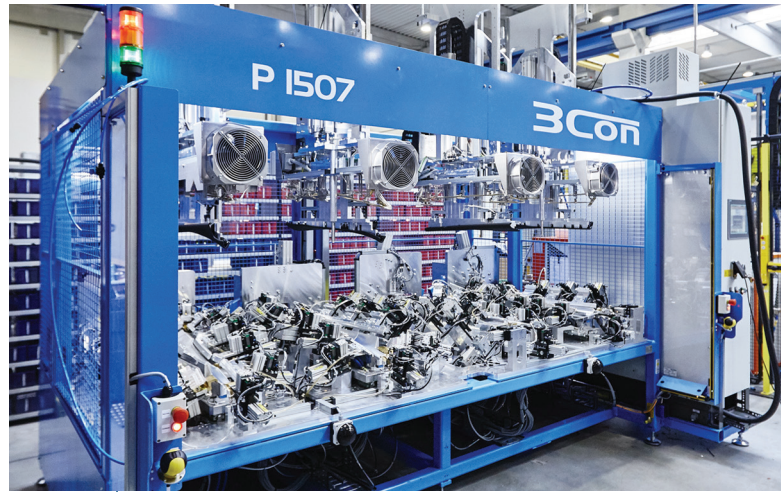
Top image: The 3DEXPERIENCE platform offers a flexible and open environment enabling 3CON to collaborate and exchange information with all stakeholders.