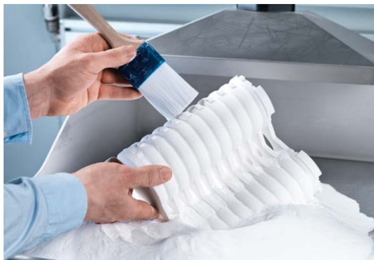
Unpacking of Bionic Handling Assistant: The gripping device is already functional even right after production.

have rather complex designs. Implementation by means of conventional manufacturing methods is impossible or difficult and always expensive. The production method determines the design of the product which all too often leads to design restrictions. Nature's efficient construction principles, on the other hand, are not subject to such restrictions. Therefore, nature can be emulated only by a technology in which the design determines the means of production and which will ideally work in serial production as well.