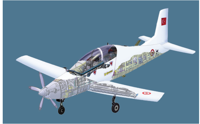
Training aircraft Hürküş TAI

and creativity of the 35-strong Mecaplex staff. Companies that include Dassault Aviation, EADS, Eurocopter, Korean Aerospace Industries, Northrop Grumman and Pilatus Aircraft.